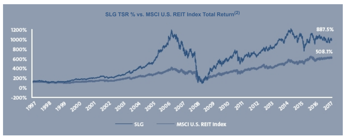
(2) Source: Bloomberg; August 14, 1997 - December 29, 2017.

Our total returns to stockholders since our IPO – over several cycles – demonstrates the enduring strength of our company and the talent of our executive team.